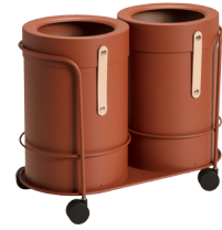
Copper Brown RAL 8004