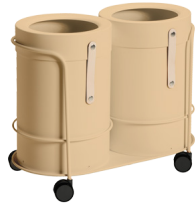
Beige RAL 1001