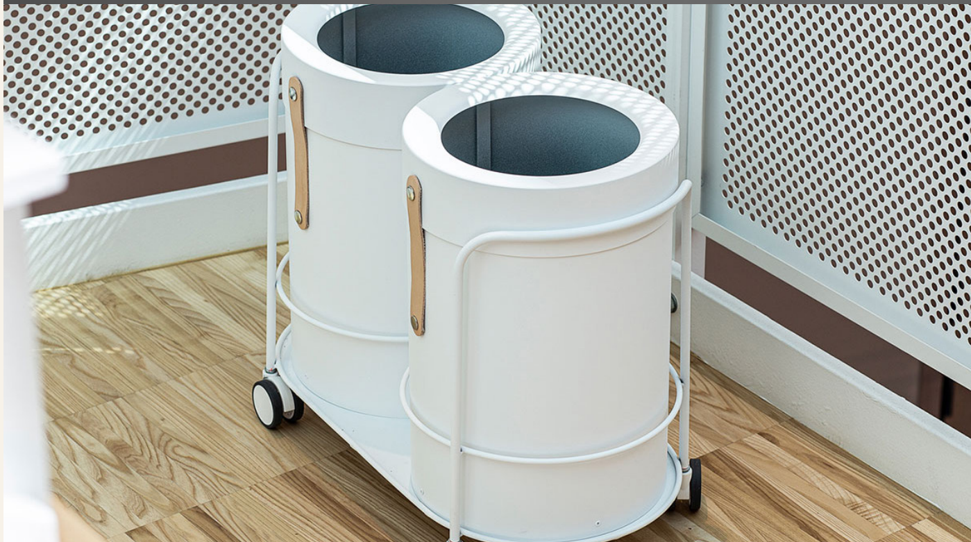
Bin There S Product Fact sheet