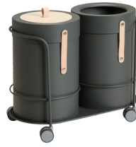
Anthracite RAL 7043