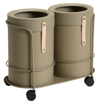
Olive RAL 7002