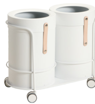
Signal White RAL 9003