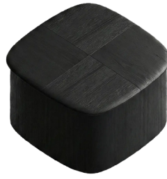
Black-painted ash. (RAL 9005)